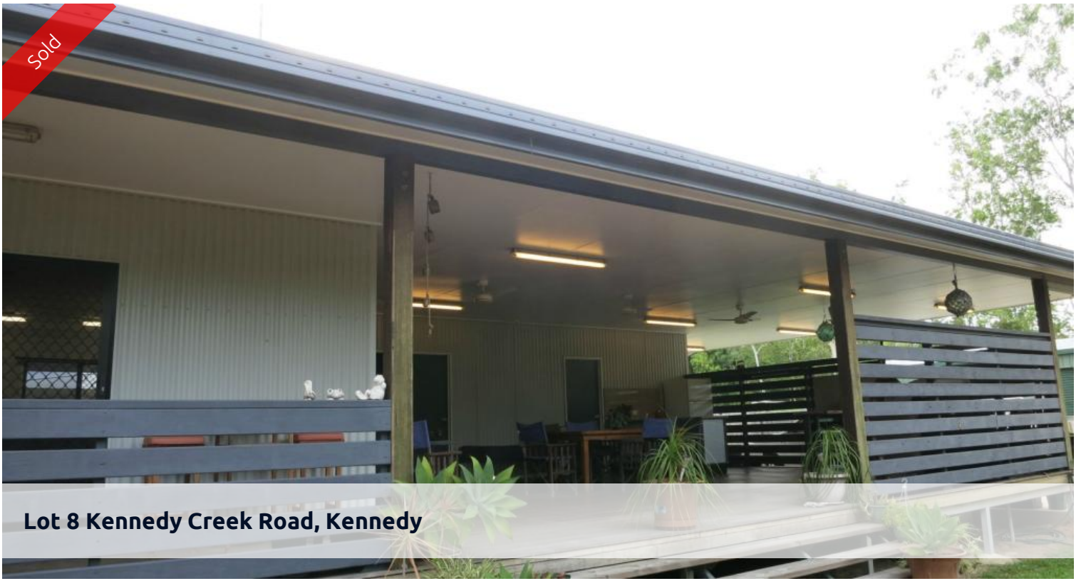
Lot 8 Kennedy Creek Road, Kennedy