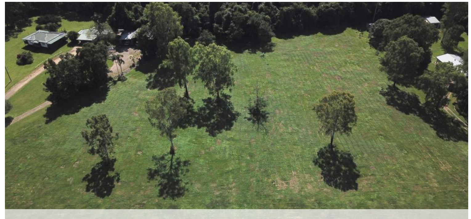
LOT 4 Bauhinia Dr, Carruchan