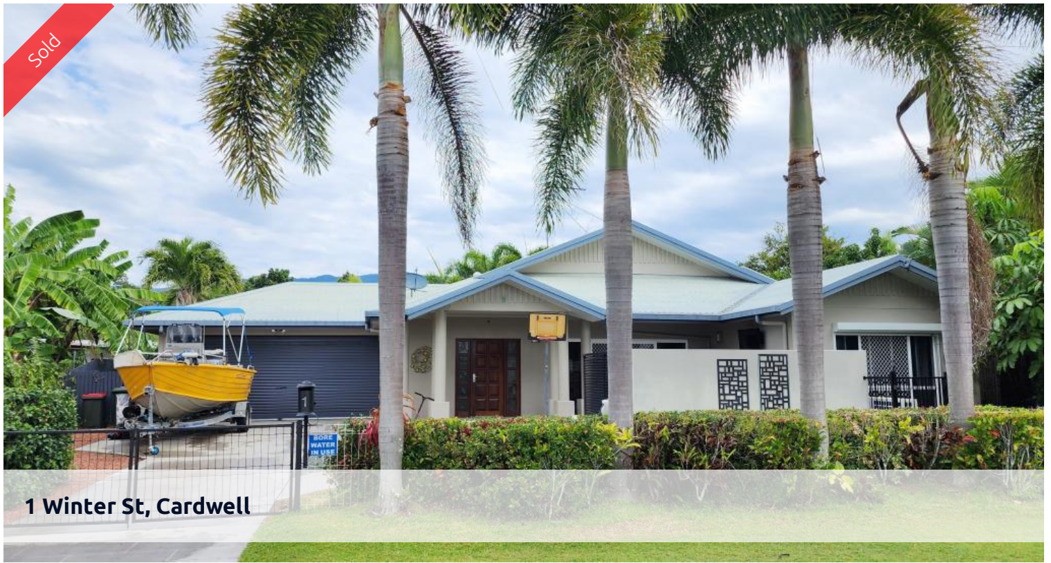
1 Winter St, Cardwell