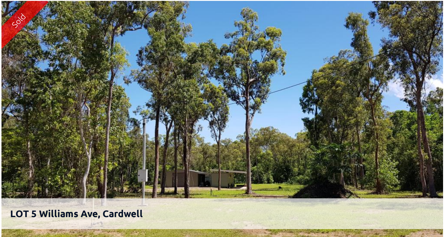
LOT 5 Williams Ave, Cardwell