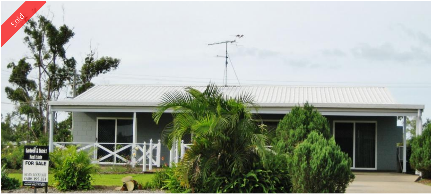
10 Lawson Drive, Cardwell